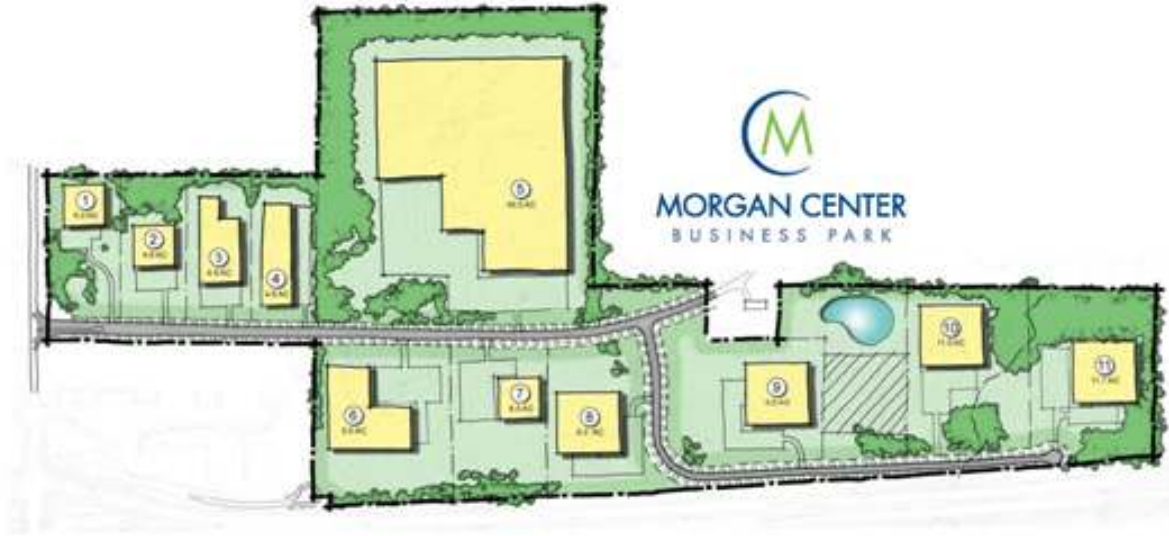
PHASE I MASTER PLAN